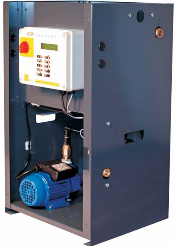
EPS-ENH shown without cover