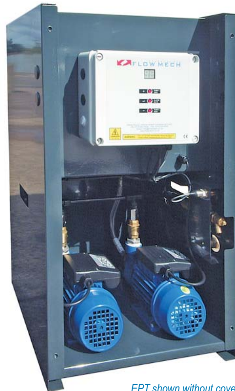
EPT shown without cover

The complete Flow Mech Products range of electronically controlled Pressurisation Units are designed for use on either heating or chilled water systems up to and including 2.8 Bar cold fill pressure. High pressure units are also available up to 6.0 bar.